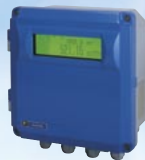
Flow Transmitter (Model:FSH)